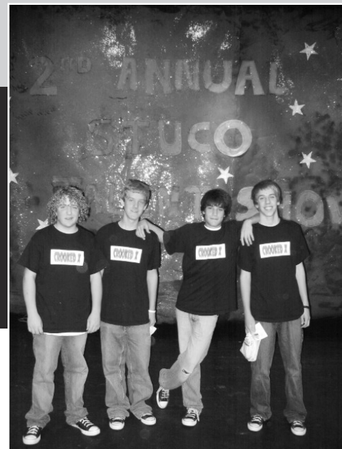
As Crooked X, Streamside appeared in the DMS Student Council Talent Show. In their second appearance the band took second overall.

Many people think of middle school bands to just end right after they write a couple of songs and play in front of their friends. Throughout the six years Streamside has existed they won a local talent show, perform for their church youth group and have now produced a CD. Friendship is their key to success and the reason why they have this group has carried on for so long.