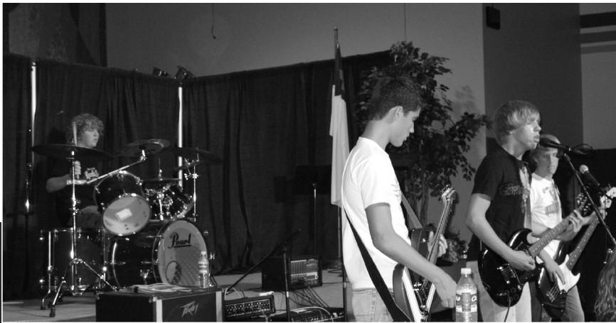
Streamside plays at Derby First Christian every Sunday during their youth group.